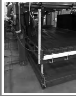
Pneumatic Connection to Machine