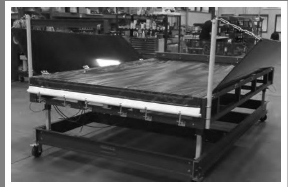
All fiberglass lightweight frame construction