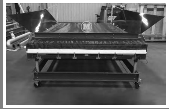
Extra Large Side Wings to keep Parts on Conveyor