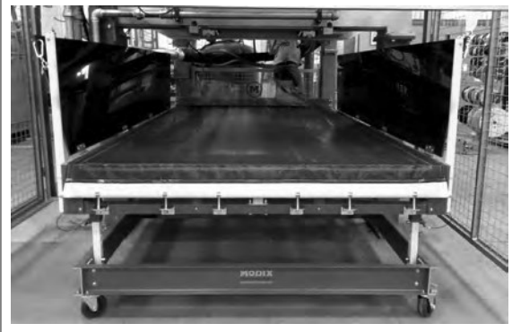
Conveyor under MDX 230 Molding Machine